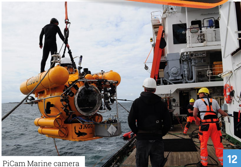
PiCam Marine camera